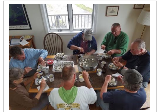
Fresh steamers for the gang on Cuttyhunk.

May 4 - Monthly Meeting – 7 PM We're meeting at the Rod and Gun Club in Edgartown. Pizza at 7 PM. Meeting at 7:30.