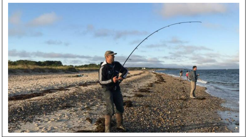
Cosmo, getting ready to land another winner.